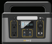
500W 560WH PORTABLE POWER STATION SD-PPS500-G1